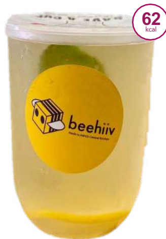
HONEY LEMON DRINK

Immerse your taste buds in our unique drinks made with the natural flavours of fruit and the crunchy chewy bites of basil seeds and more.