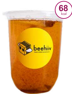
APPLE 'PIE' CIDER