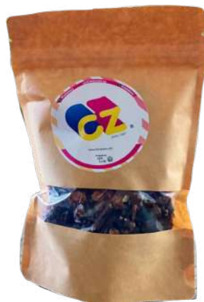
MIDNIGHT GRANOLA POUCH