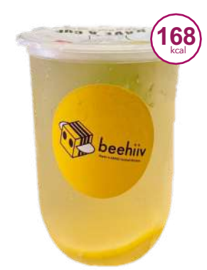
HONEY LEMON YUZU JELLY