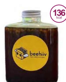
MILD SPRING COLD BREW