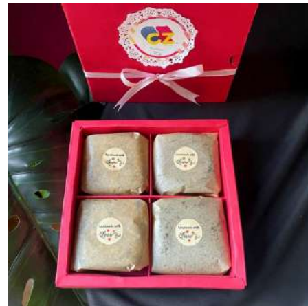
ZERO SUGAR BLACKOUT BROWNIE LOVER $25