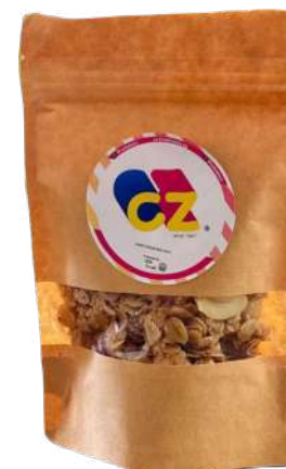
CASHEW GRANOLA POUCH

*Choose any for bundles with healthier snacks option