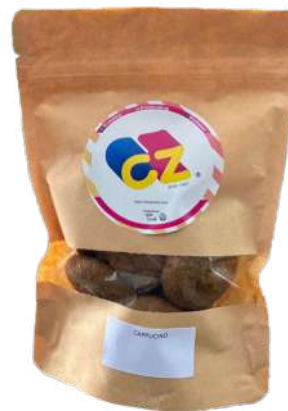
CAPPUCCINO COOKIE POUCH