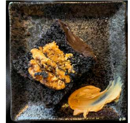
PEANUT BUTTER BLACKOUT BROWNIE $4.50