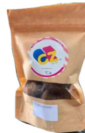
DARK CHOCOLATE COOKIE POUCH