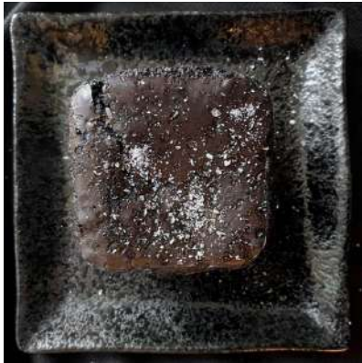
SIGNATURE SEA SALT BLACKOUT BROWNIE $4.50

Satisfy your sweet tooth cravings with our healthier selection of zero-sugar bakes that has just the right amount of sweetness and nutty goodness for the indulgence without the guilt.