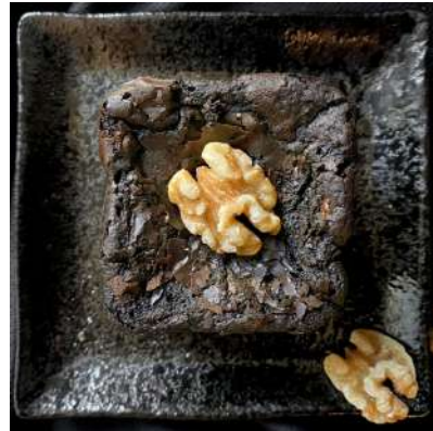
WALNUT BLACKOUT BROWNIE $4.50