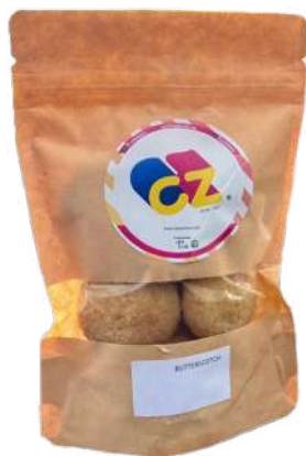
BUTTERSCOTCH COOKIE POUCH