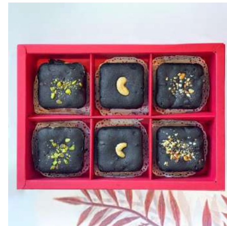
ZERO SUGAR ASSORTED BLACKOUT BROWNIE $30