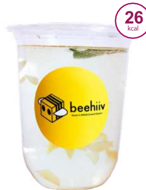
GINGER SPICE APPLE CIDER