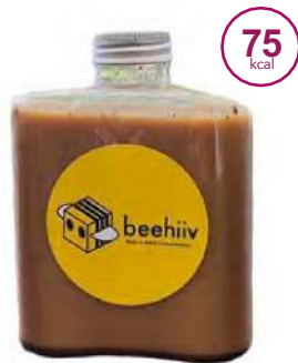
BABY CHOCOLATE COLD BREW