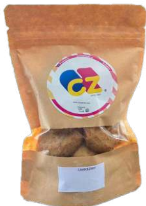
CRANBERRY COOKIE POUCH

Satisfy your sweet tooth cravings with our healthier selection of treats that has just the right amount of sweetness and nutty goodness for the indulgence without the guilt.