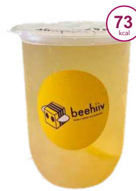
HONEY LEMON GINGER