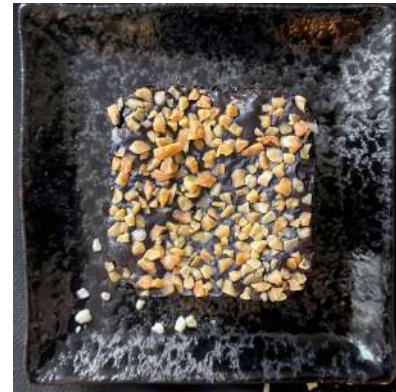
NUTTY BLACKOUT BROWNIE $4.50