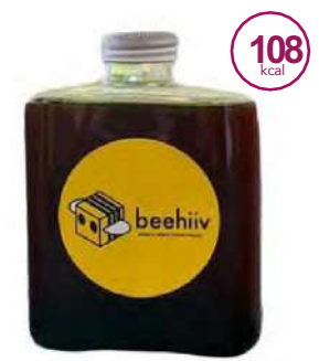
RICH AROMA DARK CHOCOLATE COLD BREW