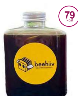
NUTTY BUTTERY COLD BREW