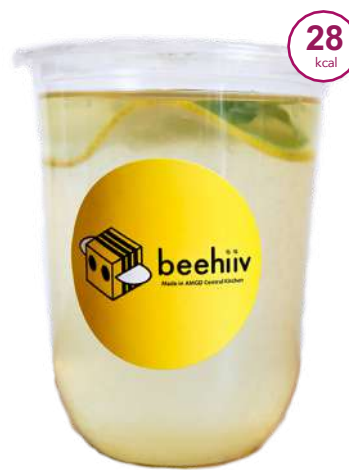
APPLE CIDER LEMONADE