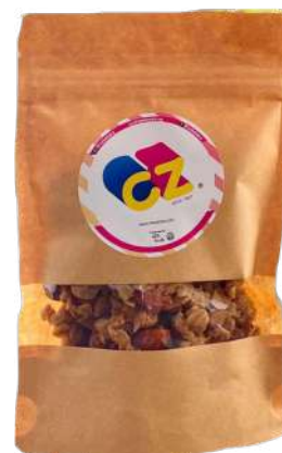
ALMOND GRANOLA POUCH