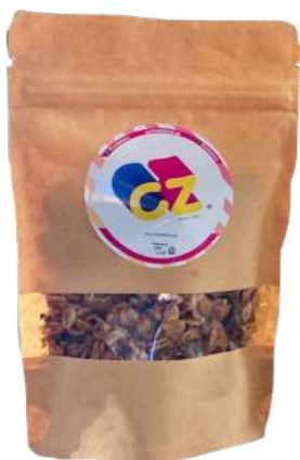
DARK CHOCOLATE CHUNKS GRANOLA POUCH